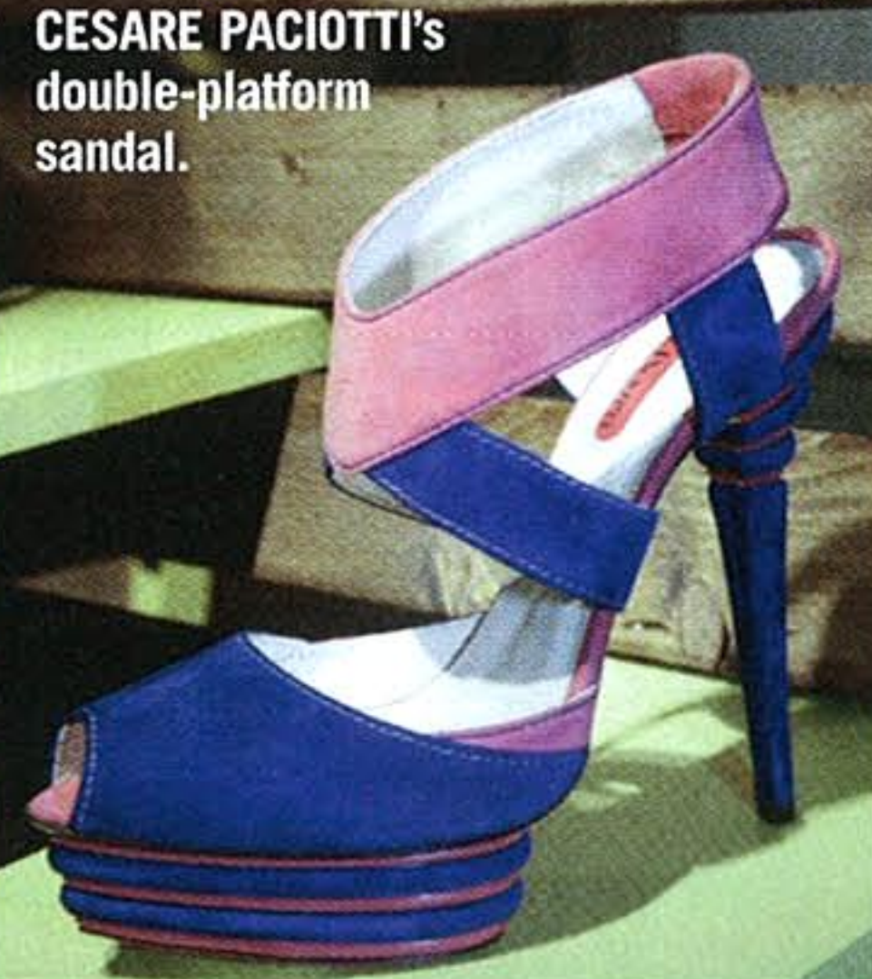
CESARE PACIOTTI's double-platform sandal.