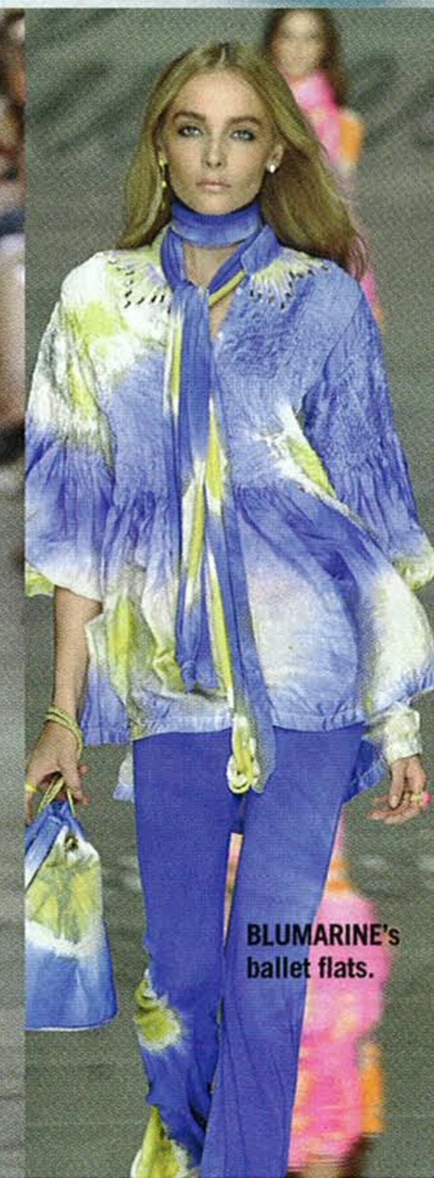
BLUMARINE's ballet flats.