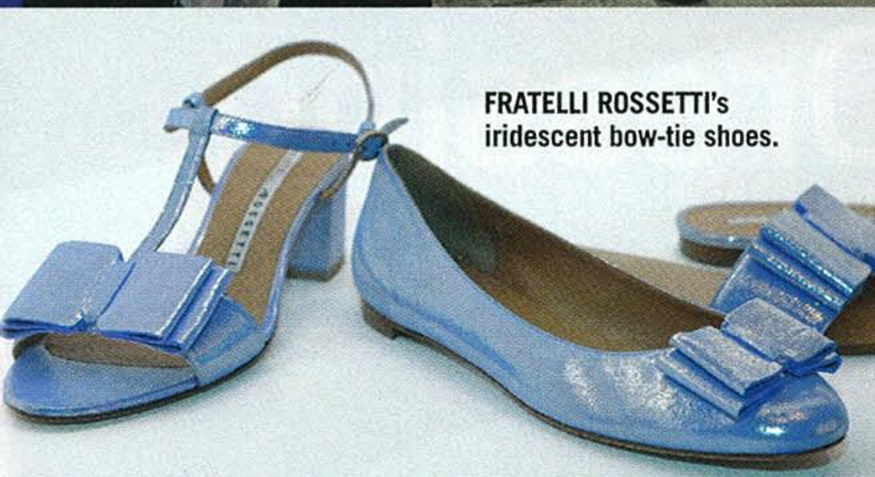
FRATELLI ROSSETTI's iridescent bow-tie shoes.