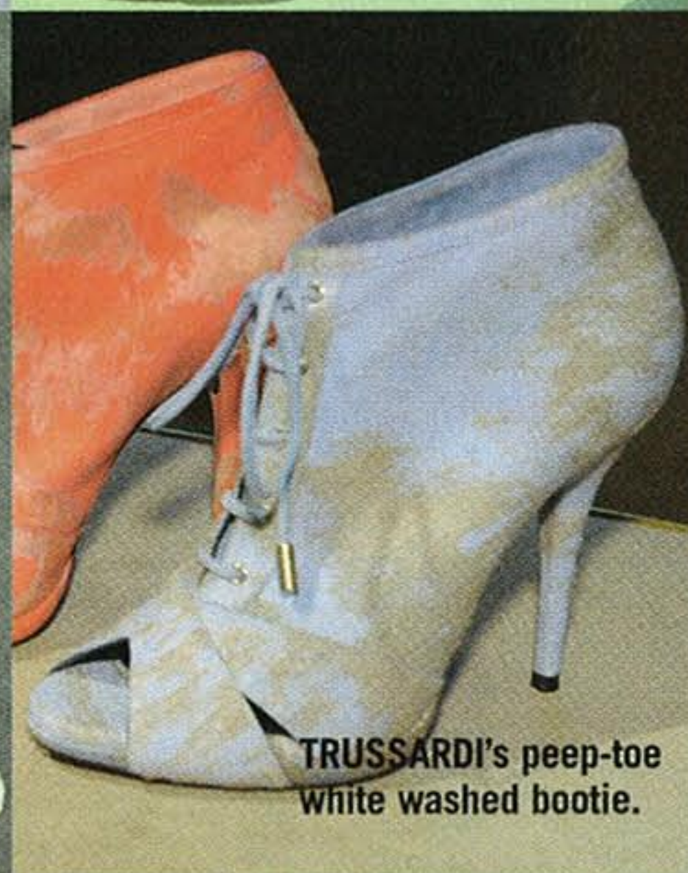
TRUSSARDI's peep-toe white washed bootie.