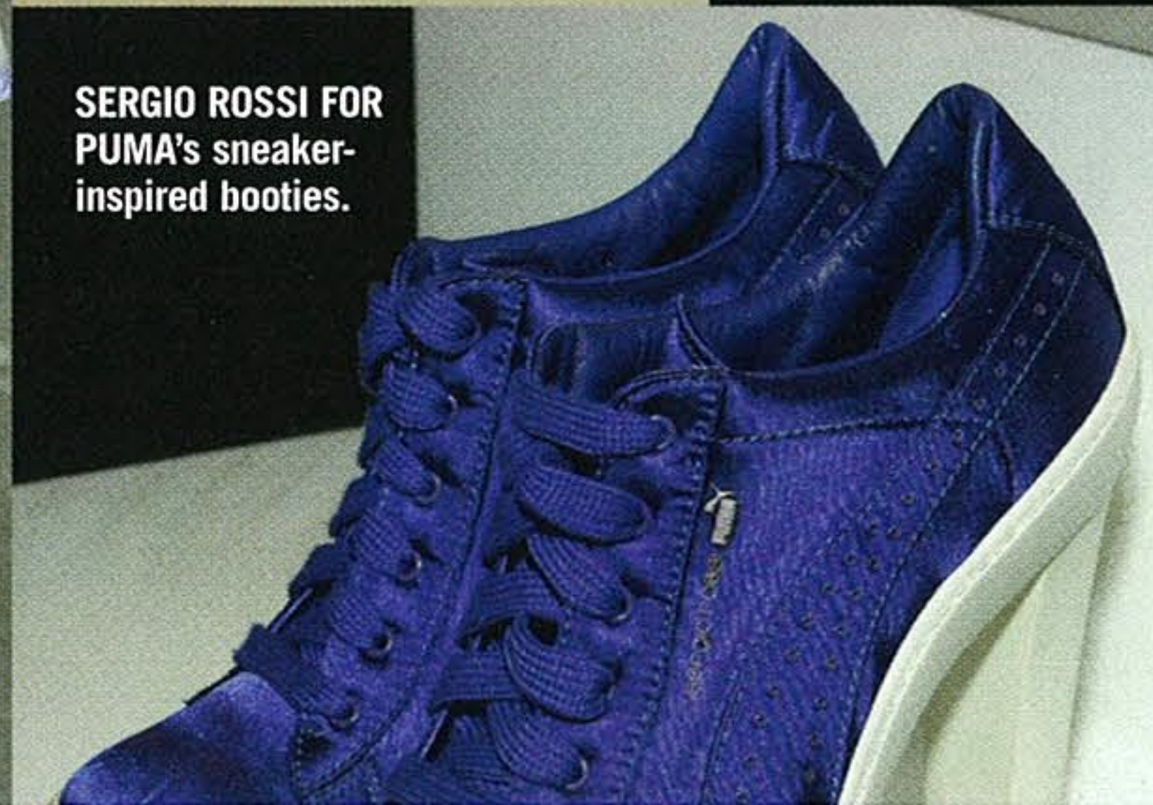
SERGIO ROSSI FOR PUMA's sneaker-inspired booties.