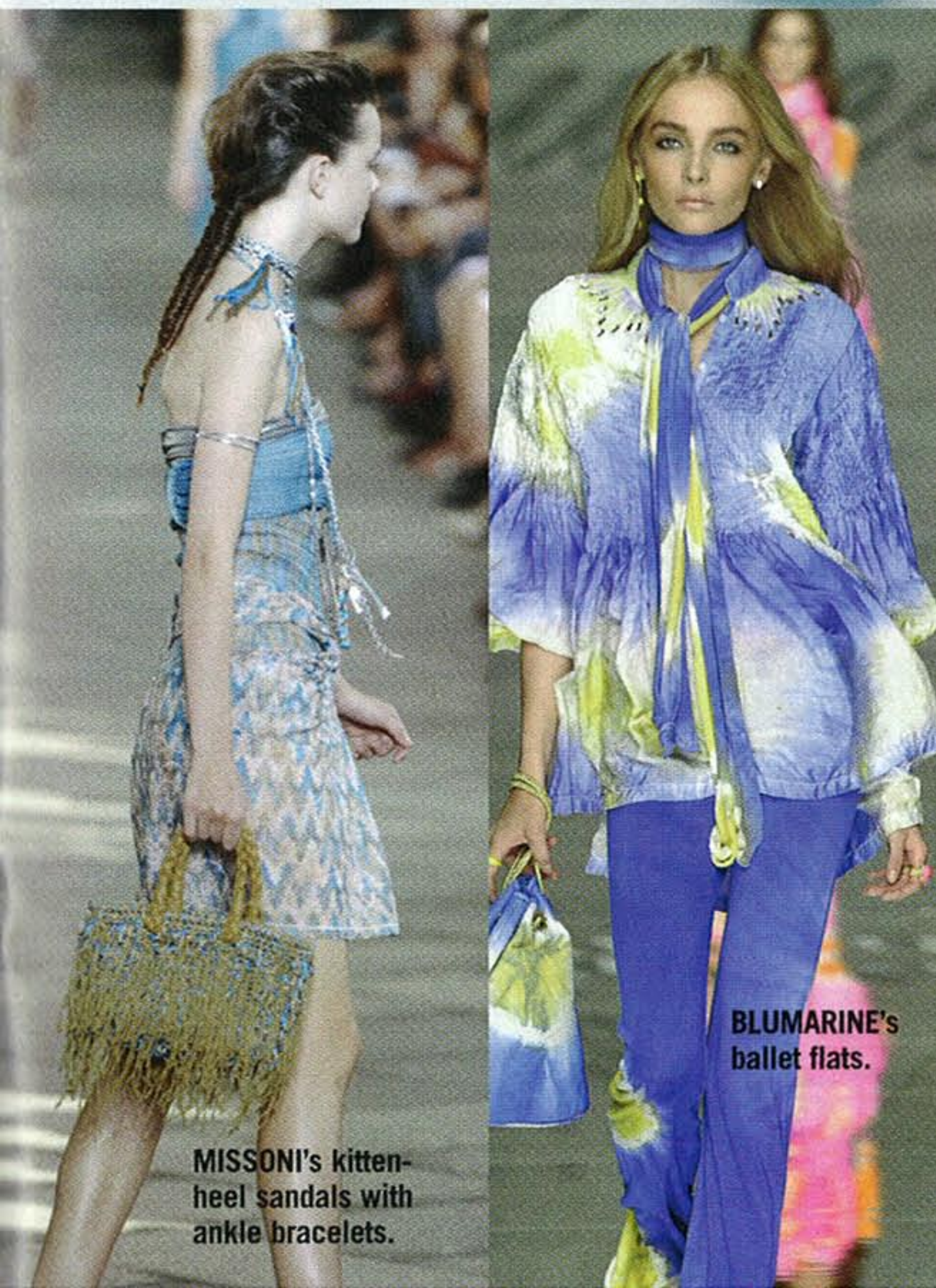
MISSONI's kitten-heel sandals with ankle bracelets.