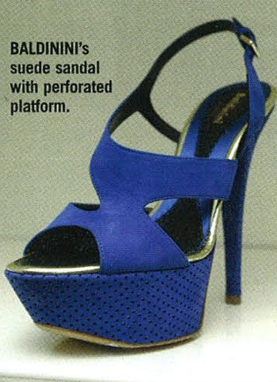
BALDININI's suede sandal with perforated platform.